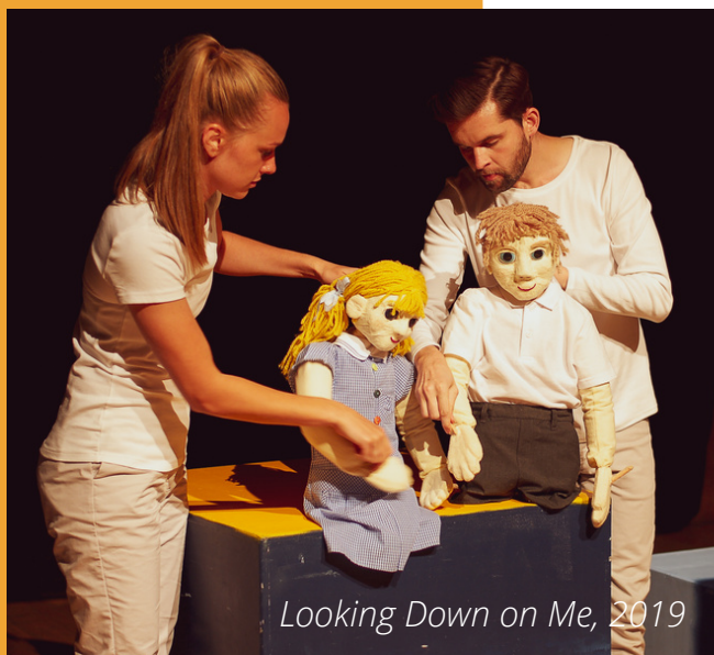
Looking Down on Me, 2019

Unexpected Places is a diverse charity dedicated to increasing awareness of and encouraging involvement in the performing arts. We have established a reputation for producing thought-provoking and endearing performances and participation projects; expect the unexpected. We achieve this through three strands of work: