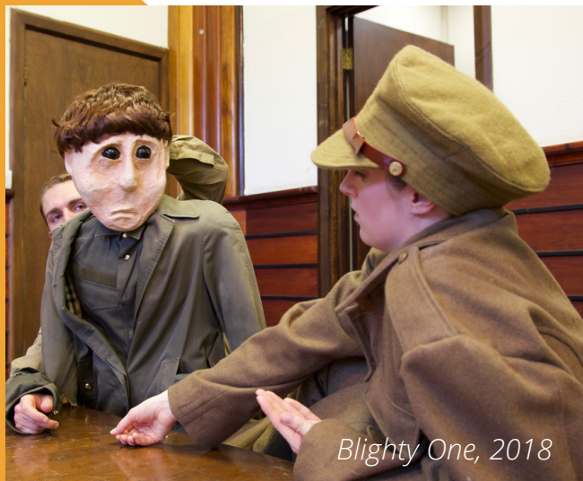
Blighty One, 2018