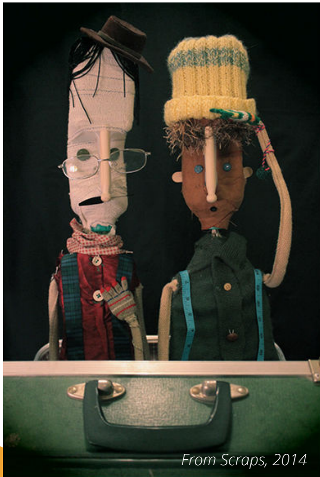
From Scraps, 2014